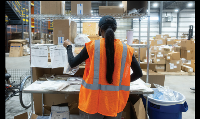
Aventure Aviation's team in the company's 70,000-square-foot warehouse, the first phase of its new Peachtree City HQ